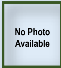
Lorraine Ledford Adult Literacy