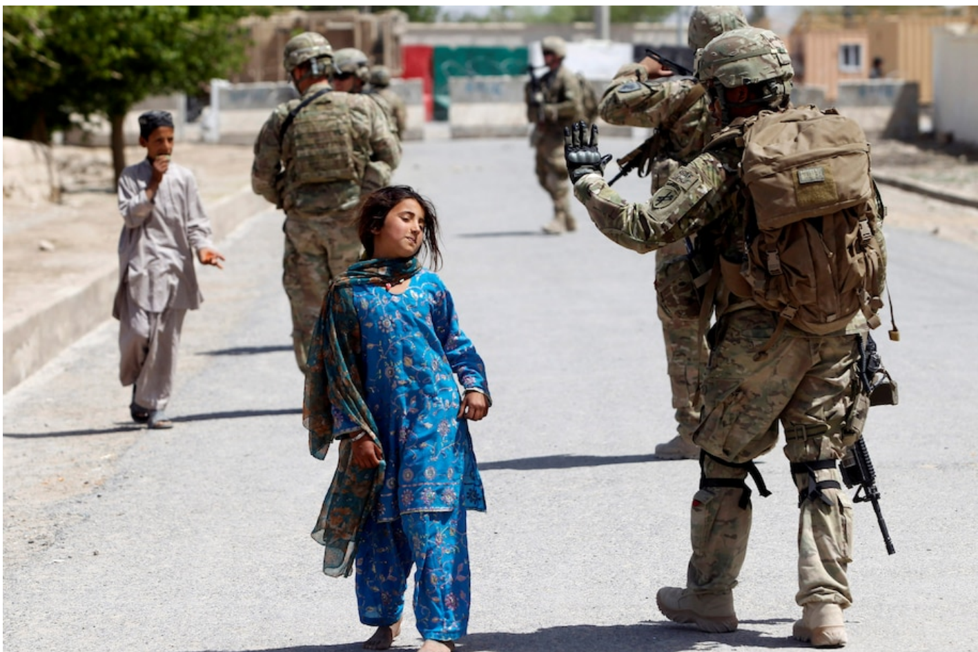
Cultural Illiteracy Led to US Failure, by Baktash Ahadi, Washington Post

What is happening in this picture on the streets of Kandahar, Afghanistan?